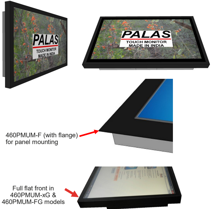
460PMUM-F (with flange) for panel mounting

Unique metal frame PCs for use in harsh environments. Rugged design. Easy mounting through VESA mounts. Smooth, easy-glide surface coating. Anti-reflective.