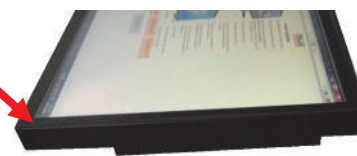
In BMxM-G model