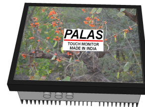
Model 150BCxM-xx-Sx fully sealed, not affected by smoke, oil, water