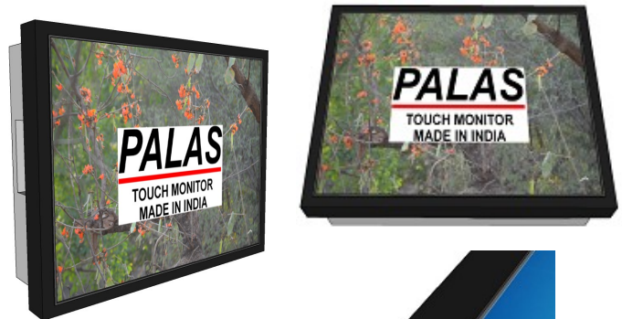
Model 150BCxM-F (with flange) for panel mounting

Unique metal frame PCs for use in harsh environments. Rugged design. Easy mounting through VESA mounts. Anti-reflective.