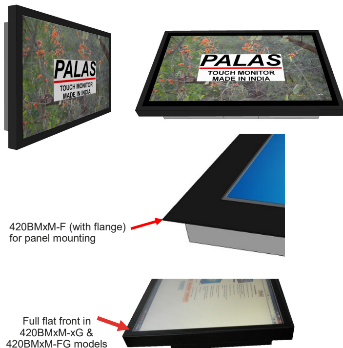
420BMxM-F (with flange) for panel mounting

Unique metal frame PCs for use in harsh environments. Rugged design. Easy mounting through VESA mounts. Smooth, easy-glide surface coating. Anti-reflective.